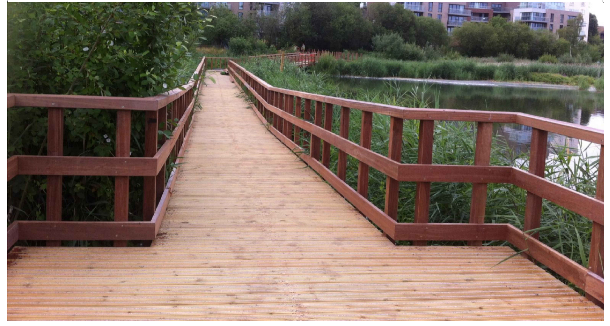
EXAMPLE OF TYPICAL BOARDWALK - CONSTRUCTION DETAIL SEE DRAWING 2016-13HBCL287D PD 002